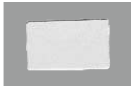
SF - 86