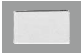
SF - 85