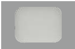
SF - 84