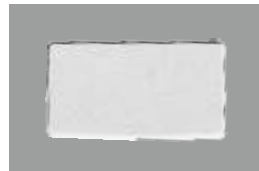
SF - 87