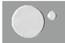
SF - 82