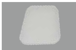
SF - 91