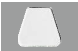
SF - 96