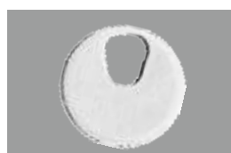
SF - 92