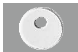
SF - 93