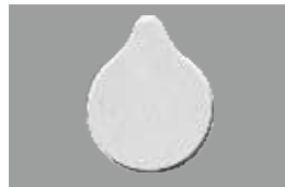
SF - 81