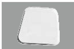
SF - 98