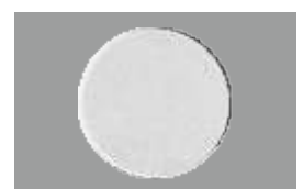
SF - 95