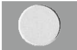
SF - 80