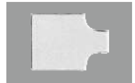
SF - 89