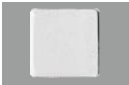
SF - 10