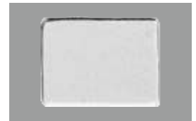
SF - 83